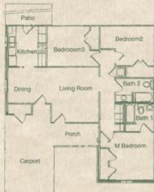
3 BEDROOM - 2 BATH